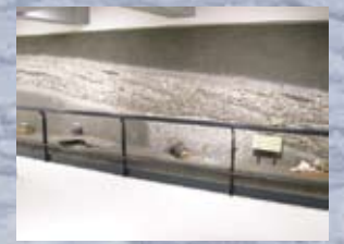
Restored shell mound

The discovery of the Moyoro Shell Mound and the history of investigation are on display.