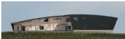
Abashiri Municipal Museum Annex Moyoro Shell Mound Museum

Kita 1-jo Higashi 2-chome, Abashiri, 093-0051 Tel. 0152-43-2608